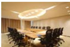
Post-Congress Seminar's room

Posters should be constructed to a maximum size of 97 cm (width) and 180 cm (height). To enable delegates to read easily the information, the lettering should be a minimum of 1 cm high. Posters should be on display throughout the conference from 9.00 hours on Saturday, 25th of September to 13.00 hours on Sunday, 26th of September. Poster set-up time is on Saturday 25th September from 8.00 to 9.00 hours when the organizing committee will be available to provide you with material with which to attach your poster to its board.