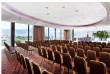
Pre-Congress Seminar's room